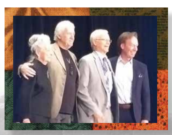
lan receiving award in Toronto at HPCO conference.