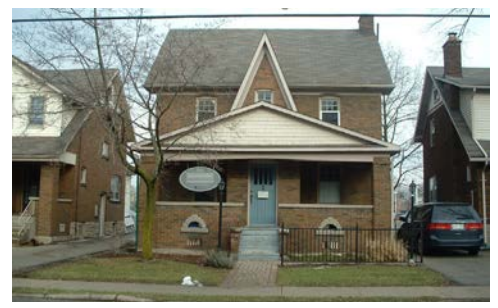
3. Park Street Hospice - 2006