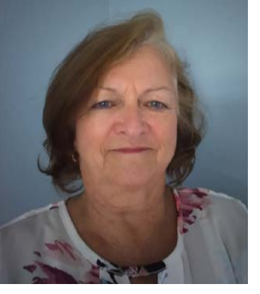
"Many things have changed over Volunteer