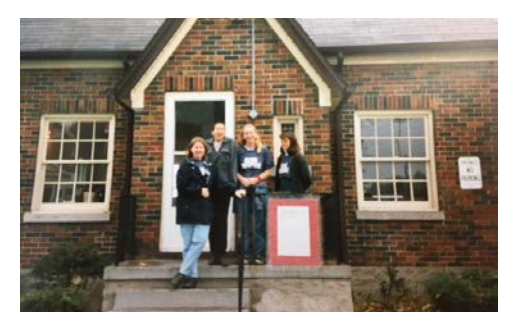
2. 66 Spadina Road West - 1997