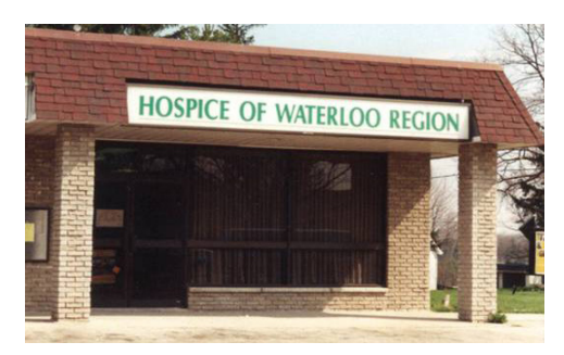
1. Dohman Street Breslaun - First offices 1993