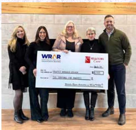
Waterloo Region Association of Realtors – Provided annual support through a generous grant