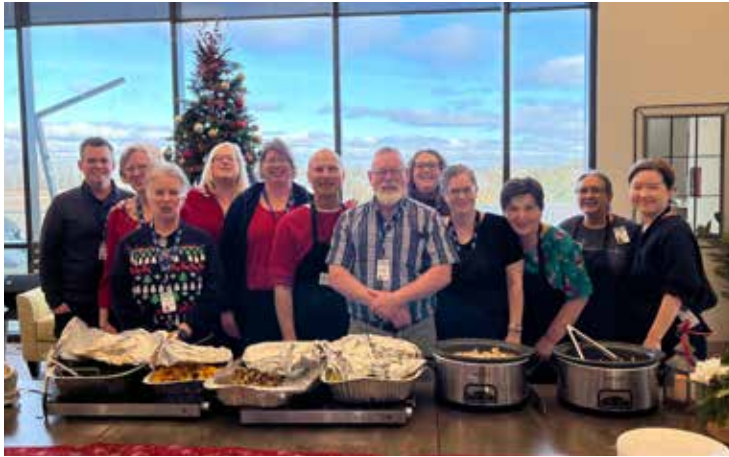
Great Lakes Poultry donated Christmas turkeys for holiday celebrations in the residence