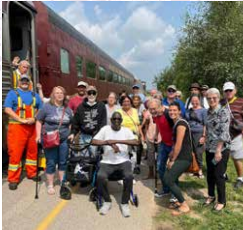
Waterloo Central Railway – provided a unique excursion for our Day Program participants