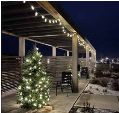
Benjamin Tree Farm & Swanson's Home Hardware – Donated trees and outdoor lighting for our Lights of Love Holiday event and displays outside of each resident room

We are grateful to the many groups and organizations in our community that hold events, donate their time and gifts in kind, or raise funds for Hospice Waterloo Region. We thank you for your support over the past year!