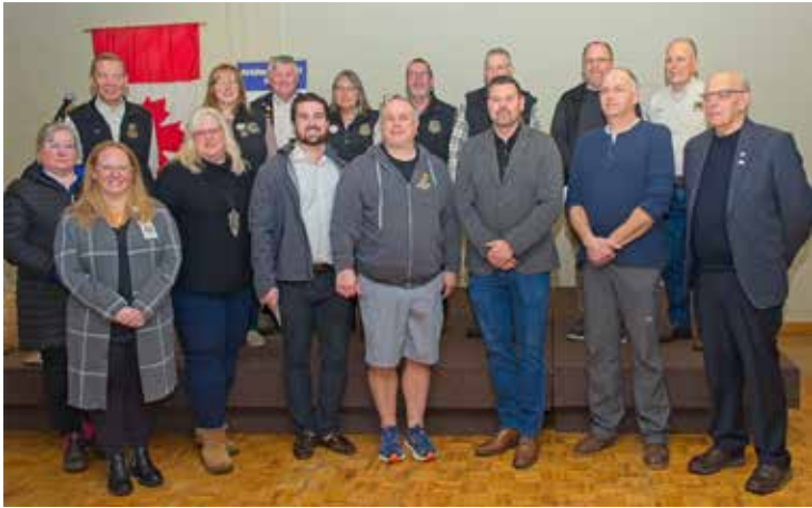
The Paradise Lake & District Lions Club – donated proceeds from their Tuesday night Bingo